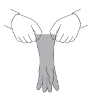
Figure 1 Hold the cuff as illustrated, with thumbs inside, and stretch the cuff slightly.